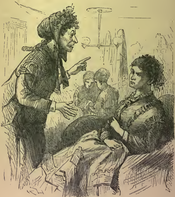
MRS. KING AND MISS COTTON.

“What's the matter?” cried Christie, pausing on the threshold.